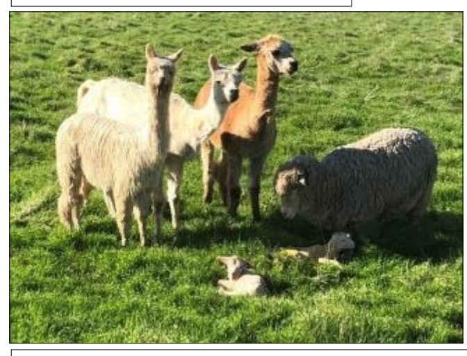
Clockwise: 1. Moorabee, Peter English - the ever vigilant mid-wives on duty during lambing.

2. Rainbow, Ellis Jelbart - if you love an old shearing shed, this one is a