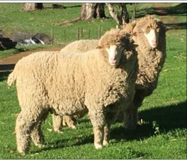
Top: Happy lambs at Clifton Polwarths in Albury, NSW Above: Mt Crawford's 1½-2½ year show rams at home. Below: Roxford, an 8 month hogget ewe fleece, 80mm.