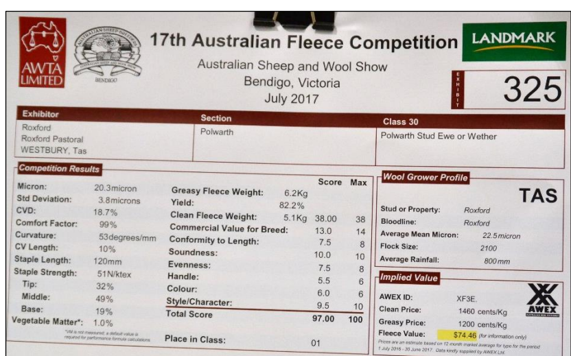
July 2017 – Australian Sheep and Wool Show Fleece Competition. Reserve Champion Fleece with a score of 97.00 won by Roxford.